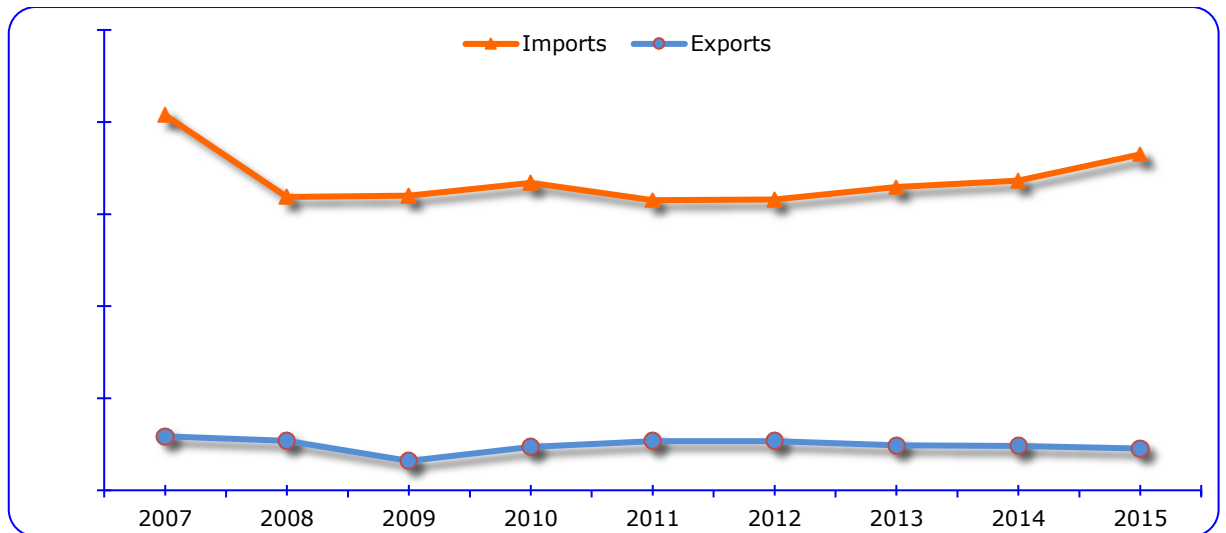
Figure 6: Trade Balance, in Value Terms, 2007-2015 (million EUR), in import/export prices